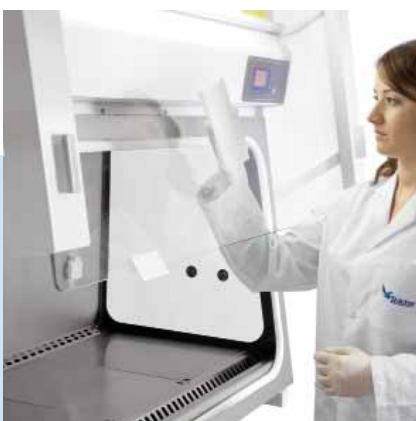
Easy cleaning of the inside window.

The Bio II Advance has a colour screen which enables easy and quick viewing of the safety parameters. The visual display shows the level of filter clogging, which is extremely useful for optimising the service. The display also shows laminar speed flow to control the cabinet's status at all times.